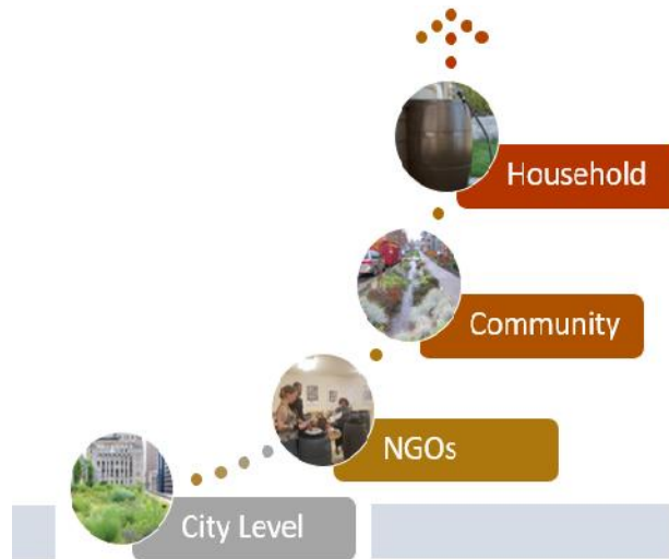
Figure 1. Multi-actor partnership