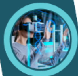
TECHNOLOGY & DESIGN