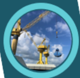
SUPPLY CHAIN INFRASTRUCTURE