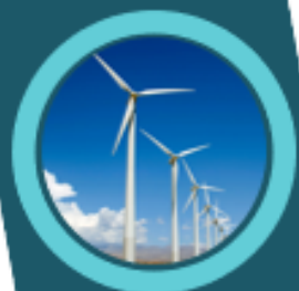
ENVIRONMENTAL & ENGINEERING